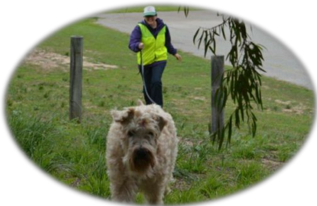
Looking down the tracklayers camera lens

PLEASE INDICATE ON YOUR ENTRY IF YOU WOULD PREFER OR ARE AVAILABLE TO BE JUDGED ON WEDNESDAY. Competitors who are to be judged on Wednesday will be notified by the SATURDAY preceding the trial.