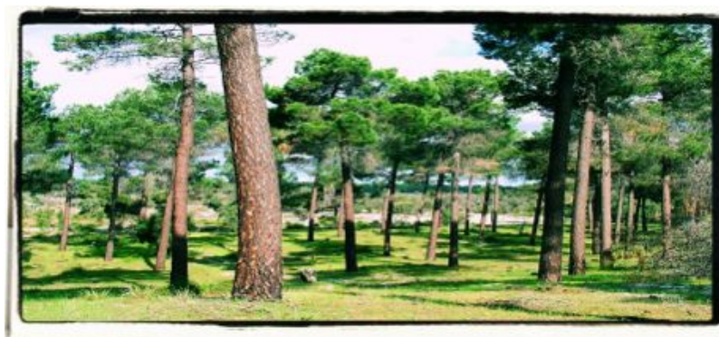
Hill opposite old base camp on Trainer Road. 2005